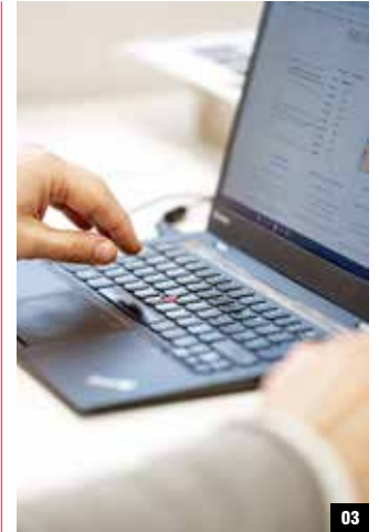
02. 03. Rejustify's solution is based on synthetic data interoperability, which is essential for companies today, as it makes data from different sources intuitively accessible for analysis.

science and make the world a better place. In business you typically use data analysis to find recurring patterns. By understanding and anticipating these patterns, companies can better capture market opportunities, and therefore boost their efficiency, revenues and growth. Bigger companies use sophisticated large-scale models to look for trends and predict future changes. But proper data processes can substantially benefit even smaller companies, by monitoring their costs, reducing waste or identifying new market opportunities.